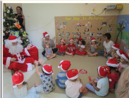
SO MUCH FUN WHEN SANTA CAME TO VISIT

December was all about Christmas! We had fun making colorful decorations, putting up the christmas tree, wrapping presents and singing christmas songs.