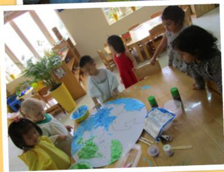
FINISHING 'OUR WORLD' USING SHAVING FOAM AND GLUE MIXTURE - BLUE FOR THE WATER AND GREEN FOR THE LAND!