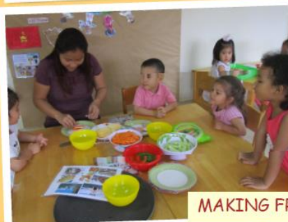
MAKING FRESH SPRING ROLLS