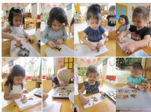
MAKING GINGERBREAD COOKIES